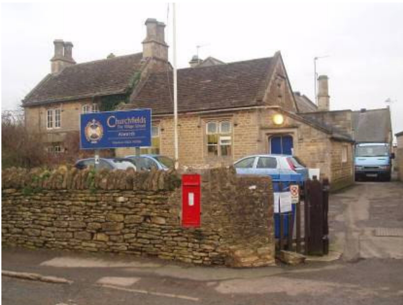
Churchfields the village school Atworth base