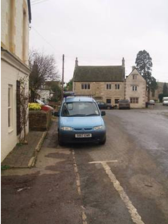
Bradford Road outside entrance to the Atworth base looking south