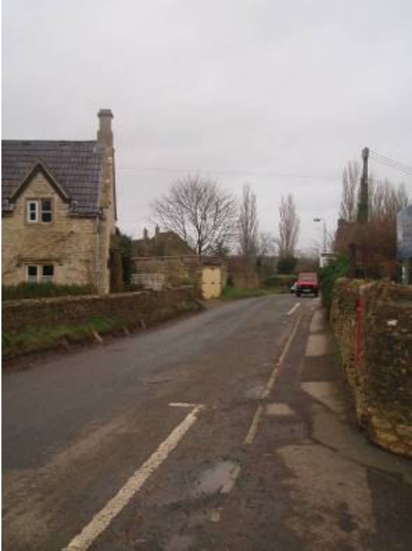
Bradford Road outside entrance to the Atworth base looking north