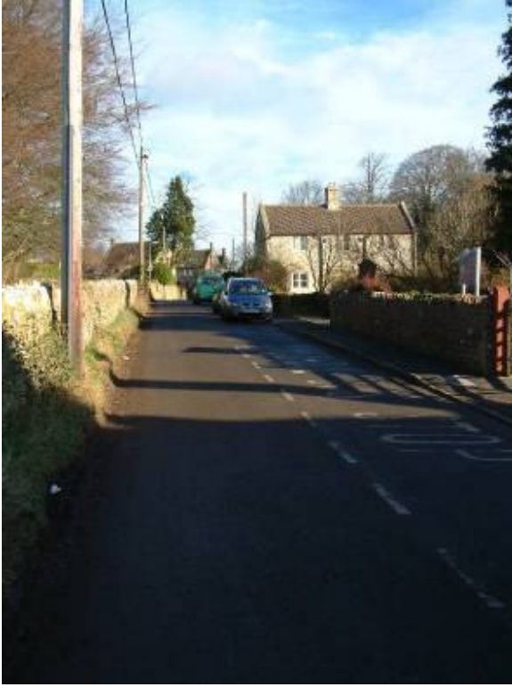
Road outside the Monkton-Farleigh base looking north