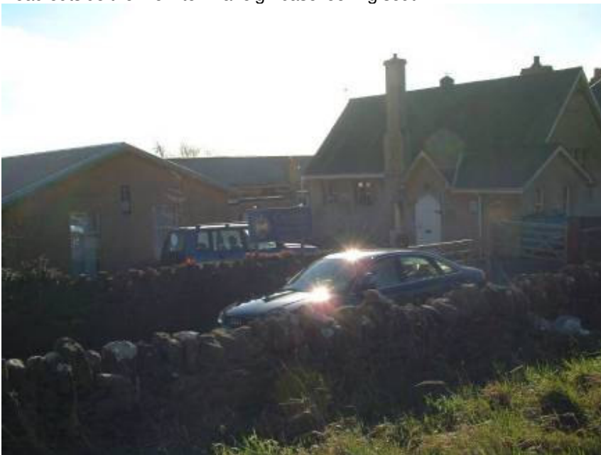
Churchfields the village school Monkton-Farleigh base