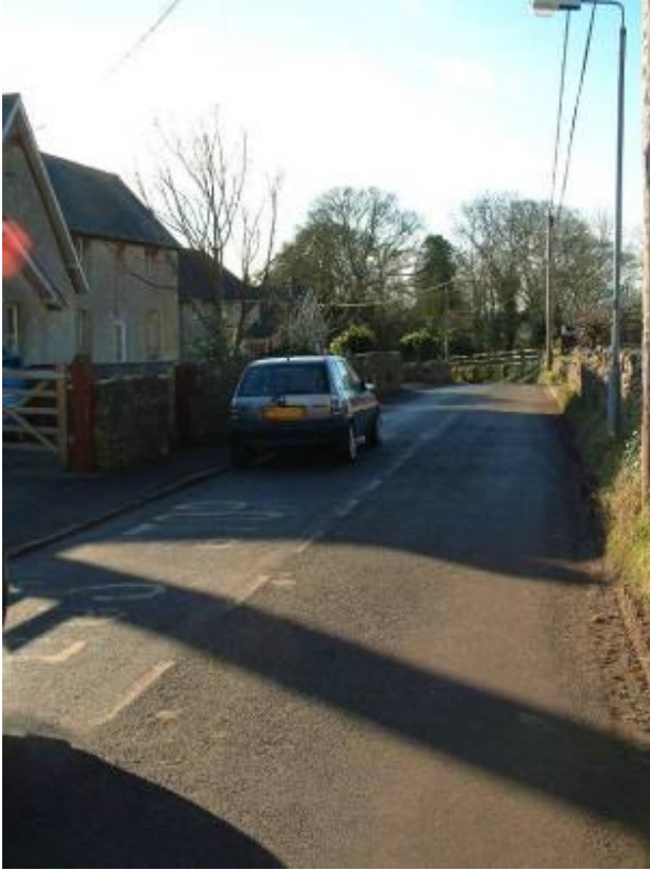
Road outside the Monkton-Farleigh base looking south